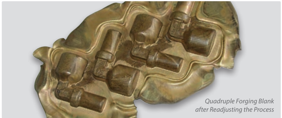
Quadruple Forging Blank after Readjusting the Process