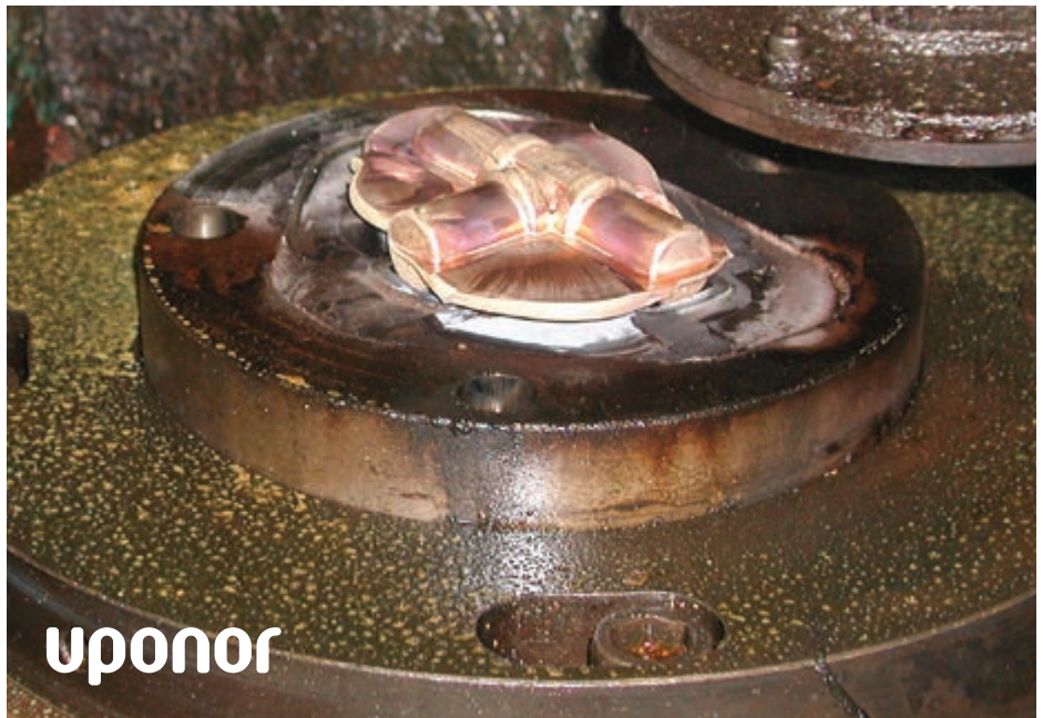
Single Manufacturing of a Brass T-Piece

In addition, Uponor is working on a new layout of the forming process with a new press. This new machine would permit hollow extrusion and thus the preforming of inner contours. The additional savings in material would be substantial. The forming energy would be received by the lower die in this case, diverted